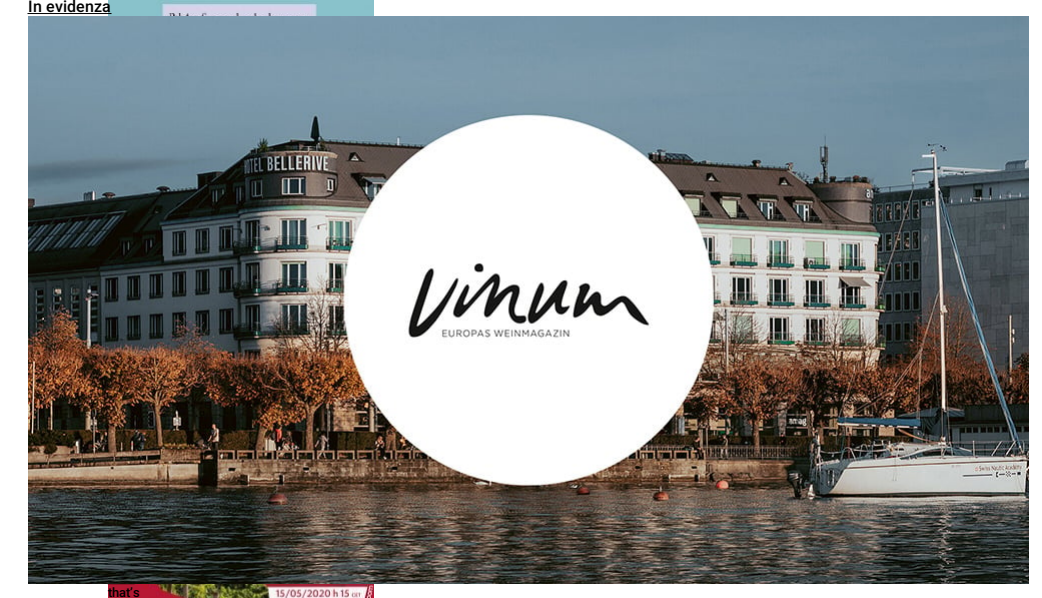
15/05/2020 h 15 or / yhat What Assovini Sicilia. Zurich, Mittwoch 30 november »